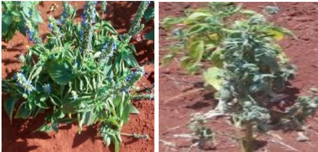
Fig. 5. Viral symptoms: leaf curling, chlorosis, wilting (images: own)