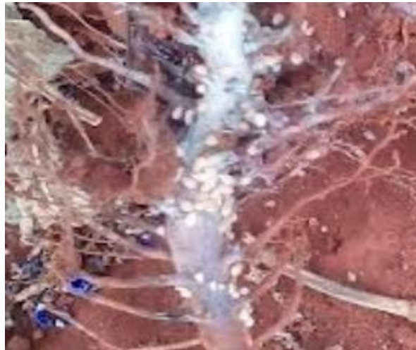
Fig. 2. Root mealy bugs (own)