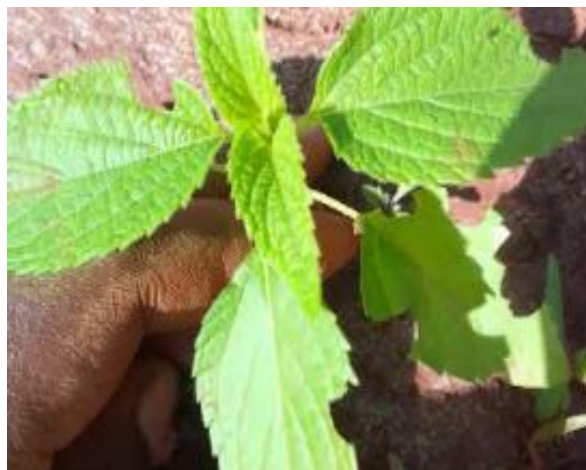
Fig. 4. Leaf damaged by chewing insects (images: own)